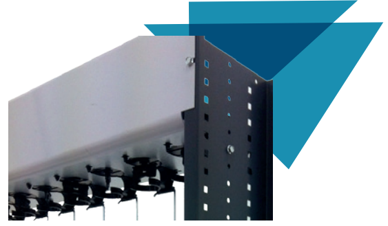
Side panel without housing